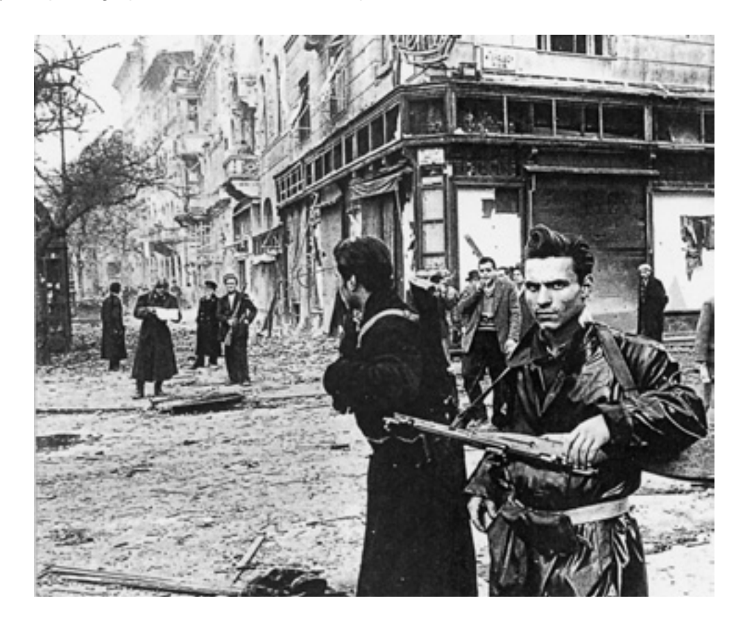
Hungarian rebels in Budapest, November 1956.

8 Study the photograph, and then answer the questions which follow.