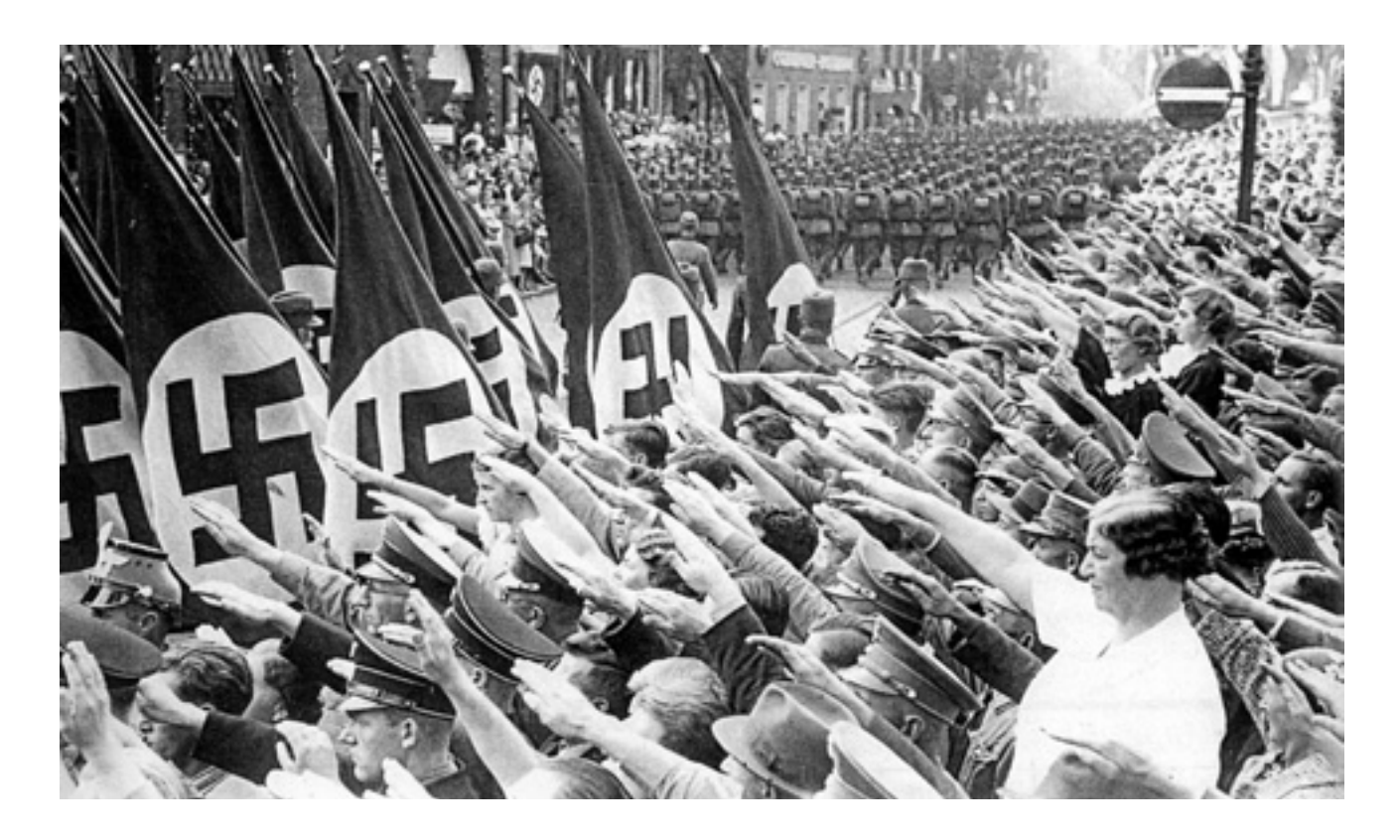
Crowds at the 1936 Nazi Party rally in Nuremberg.

10 Study the picture, and then answer the questions which follow.