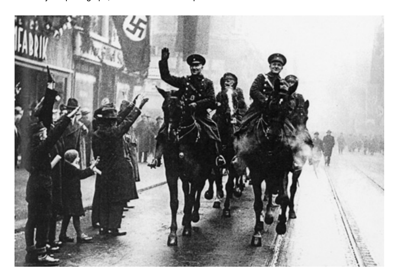
People in the Saar celebrating the results of the 1935 plebiscite.

6 Study the photograph, and then answer the questions which follow.