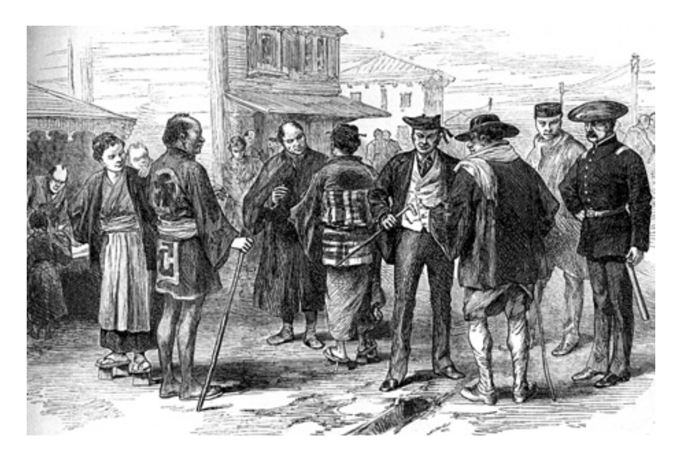
Traditional and western costume in Japan, 1873.