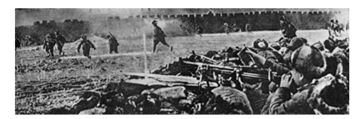
A photograph of Communist troops advancing in the Civil War.

15 Study the photograph, and then answer the questions which follow.