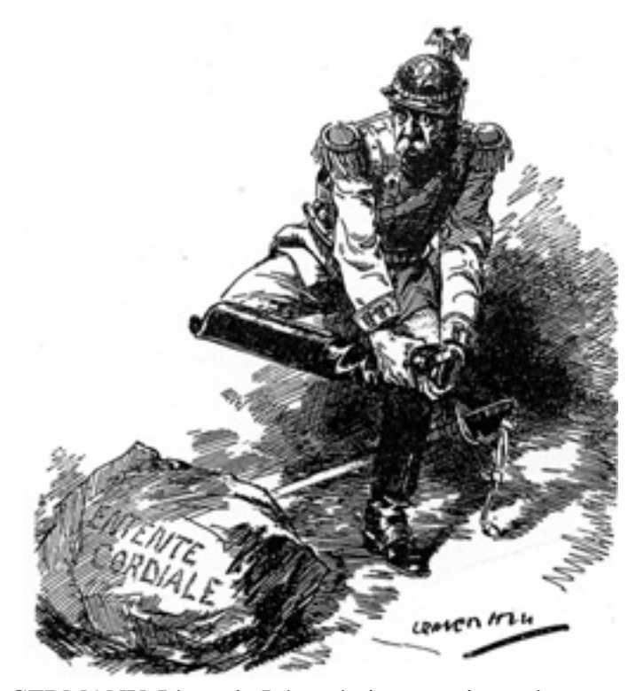
GERMANY: It's rock. I thought it was going to be paper.

4 Look at the cartoon, and then answer the questions which follow.